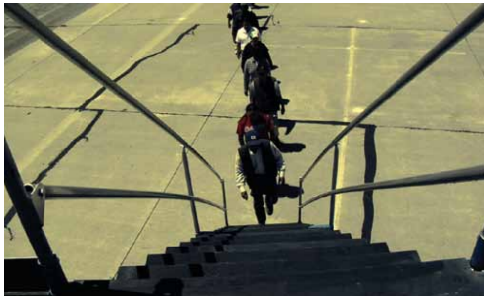
Adrian Paci. Centro di permanenza temporanea (Centre of temporary permanence), 2007 Videoprojection. 5' 30" Colour, with sound

The series of exhibitions entitled What To Think , What To Desire , What To Do considers the context of deep crisis suffered by the contemporary economic, social and moral system and explores the role art can play within this state of affairs. Curated by Rosa Martínez, independent art critic and Director of the 2005 edition of the Venice Biennale, the series intends to question art's utility, to show how it can guide us both existentially and politically, and to celebrate its ability to trigger emotional and intellectual reactions that arouse our awareness and prompt us to modify our actions.