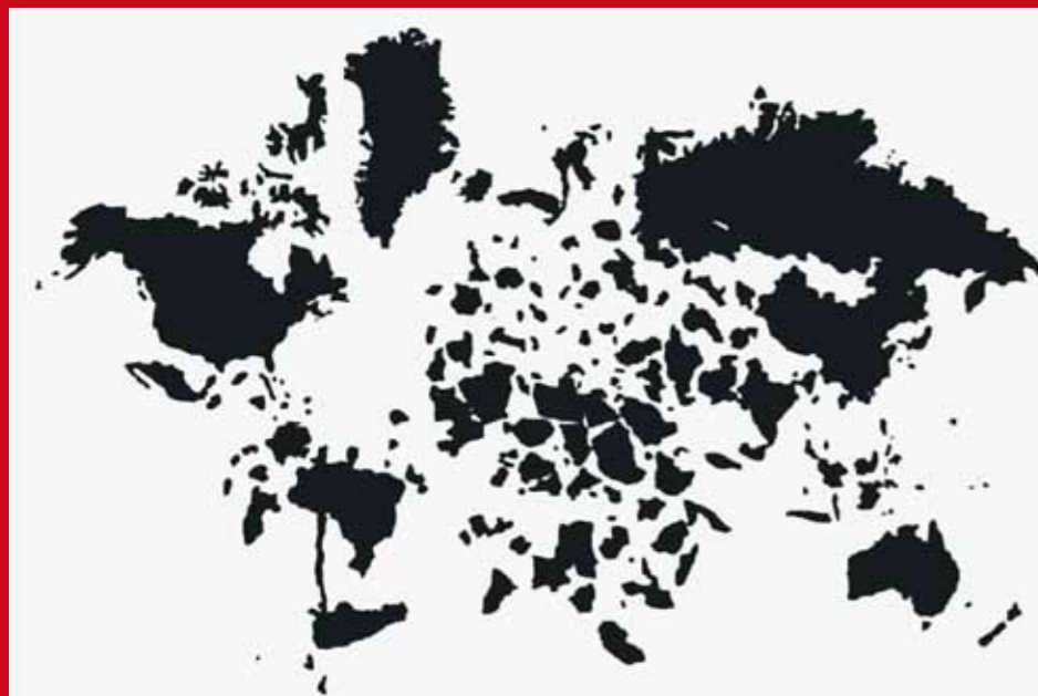
Carlos Amorales. Useless Wonder , 2006. Two-channel video projection on suspended screen, 8' 36" Colour, sound 7' 51" White and black, no sound

"la Caixa" Foundation Contemporary Art Collection