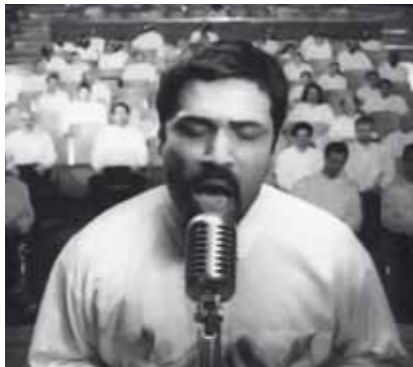
Shirin Neshat. Turbulent , 1998 Two-channel video projection Laserdisc transferred to DVD 10' White and black, with sound